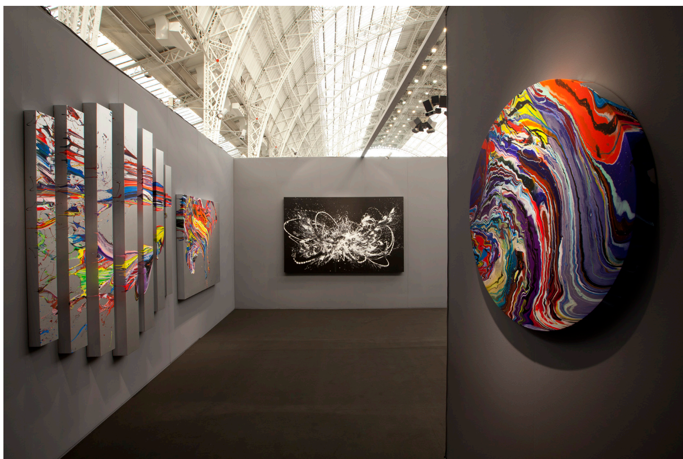
"Riding Awareness Messenger molecule" - 370x250x14cm installation / "Gene&Ethics Stardust master" - 270x170x10cm "DNA Planet" - D100x6cm // all works are acrylic on canvas - 2012/13