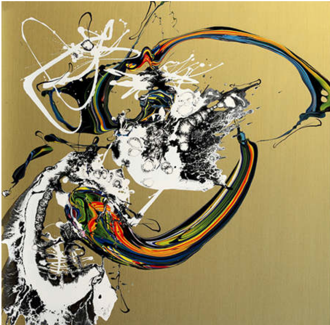
"Golden Awareness", Leak of Information series - acrylic on canvas - 100x100cm - 2011

Have you ever had this odd feeling that they do not tell us everything, that some elements of the story are deliberately hidden? Either the lie is too big to be swallowed or the truth is so well concealed that the affair is known a long time after, thanks to people who have led an investigation, decoding messages and in many case have fought against a system. This is what "Leak of Information" means and with what it deals. The bells are ringing: (public) awareness!