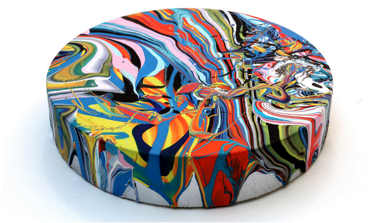
“Peace of Cake”, Mothernature series - acrylic on canvas - 30x30x6cm - 2011