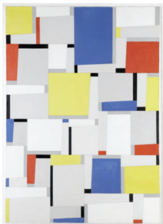
Fritz Glarner "Relational Painting No. 63" Oil on canvas 152,5x101,5cm 1953