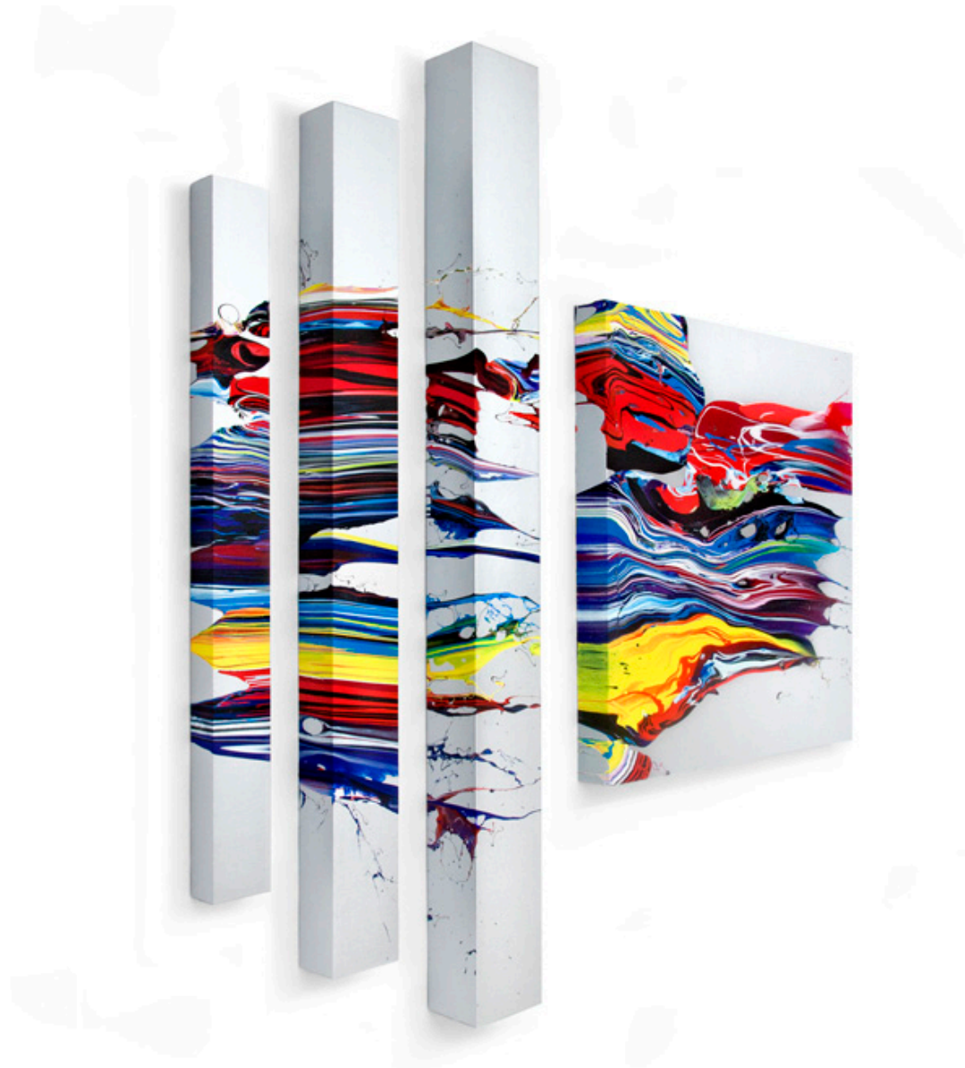
"Riding awareness - K syndrome" - Installation 220x330x16cm - acrylic on canvas - 2013

Katrin Fridriks' works will include perspective studies of her colorful Crayons, Silver Awareness & Full Macro series, combining colorimetric & drippings-based research & construction of pictorial spaces. Her compositions exclusively displayed for India Art Fair explore dimensional aspects of her abstract paintings. In the vein of the "Riding Awareness – Messenger Molecule" installation, she plays with the size, thickness and format of the canvases, carefully assembled together so as to bring other & new perspectives. The architectural dimensions of her abstract paintings highlights Fridriks' interest for large-scale works. In parallel & inherent to this process, her drippings enlargement continues, from thin swings, one-gesture bigger splashes to the whole canvas covering.