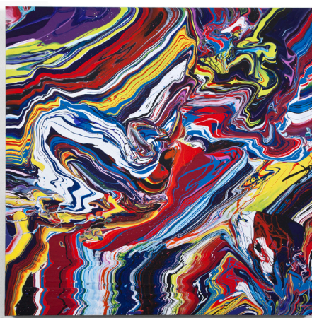
Katrin Fridriks "magic K syndrome - cytoplasm DNA" Acrylic on canvas 130x130cm +10cm dec 2013/2014