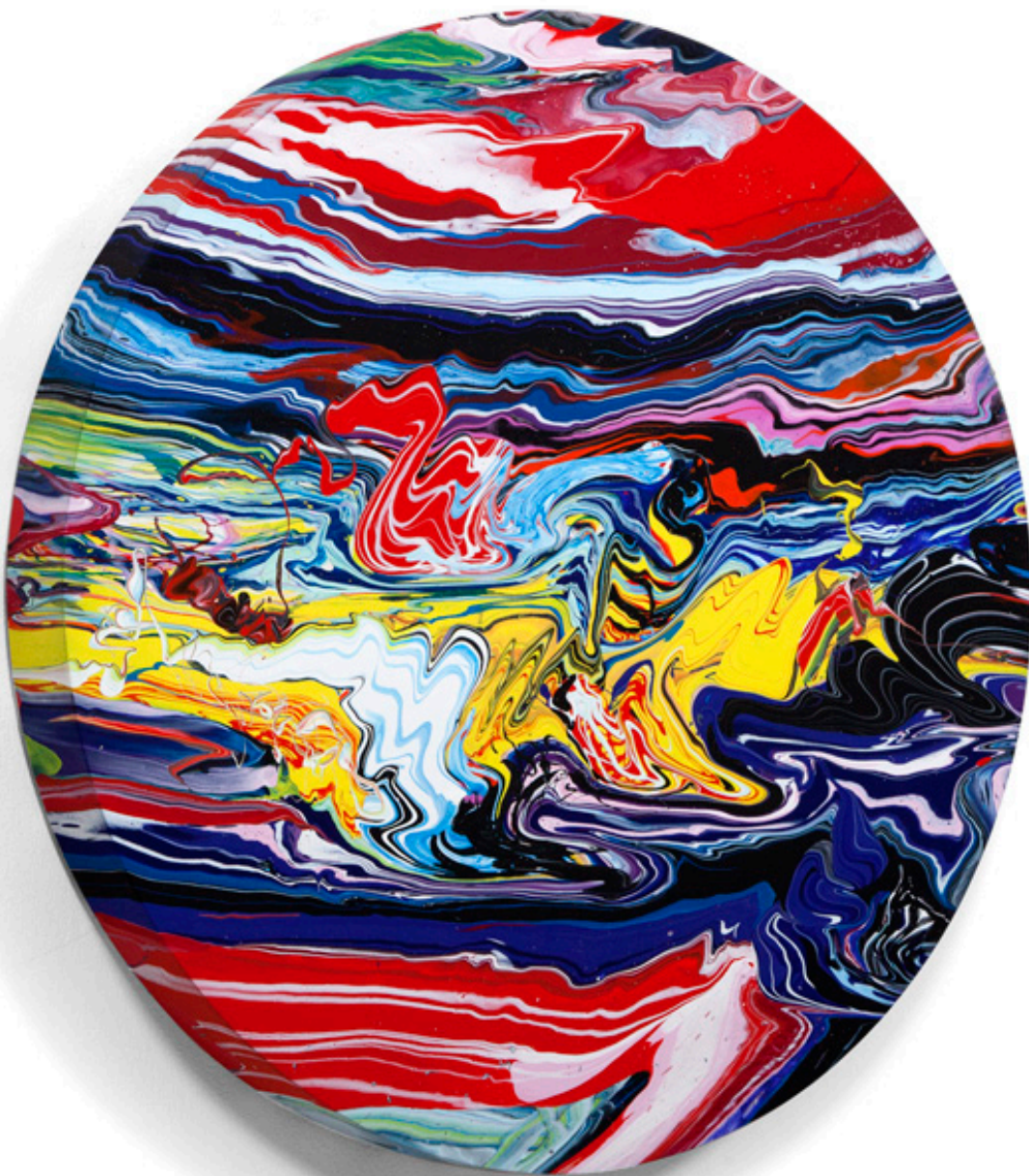
"Galaxy Mothernature" - D110cm +11cm - acrylic on canvas - 2013