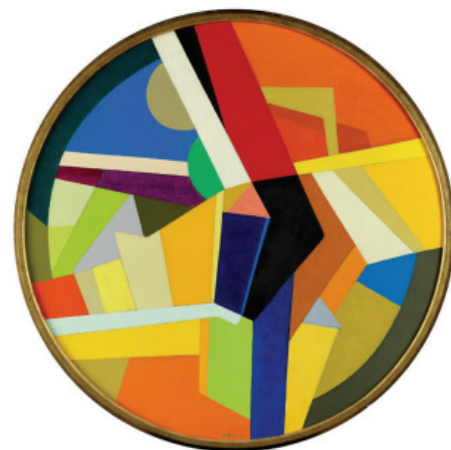
Maurice Estève "Hottie" Oil on canvas (tondo) D81cm 1978