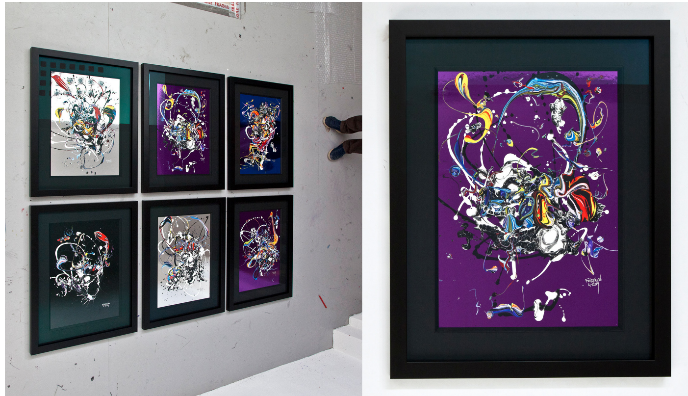
"Skylanders" series - installation 177x211x4cm - acrylic on reflective paper (gr 370) - 2014

The "reflected papers" match a double reflection/research: A pictorial research aligned with the process of her series "Awareness" (2011) and its metallic orientation using "gold, silver, copper, steel...". The second line of research focuses on the new media. Manufactured using an high quality film, these so-called reflective papers produce a new & relevant energy of surface. The brightness and the mirror effect of the metallised surface enhance the contrast with the mat paint.