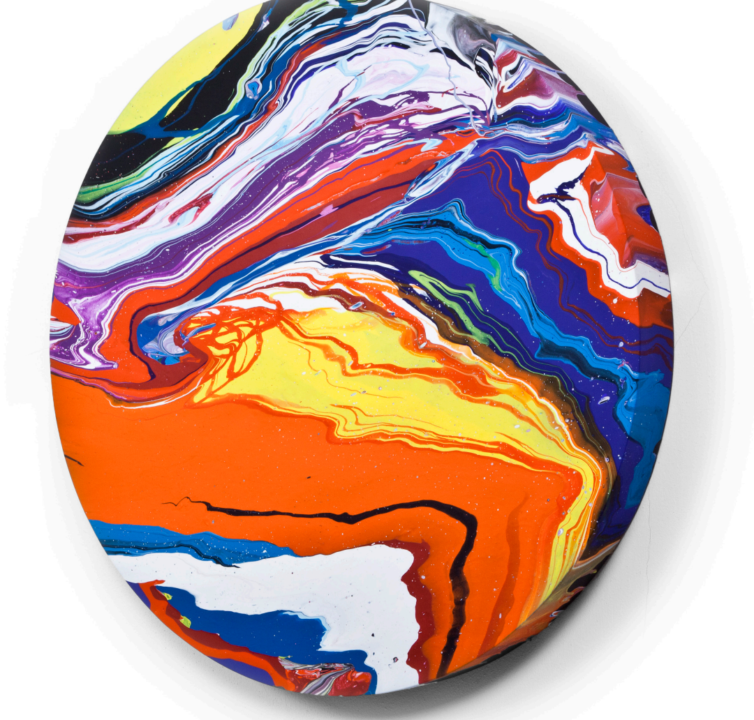
"Lollipop n1 - Odyssey" - D90x9cm - acrylic on canvas (with black plexi stick : 160xD90x12cm) - 2014