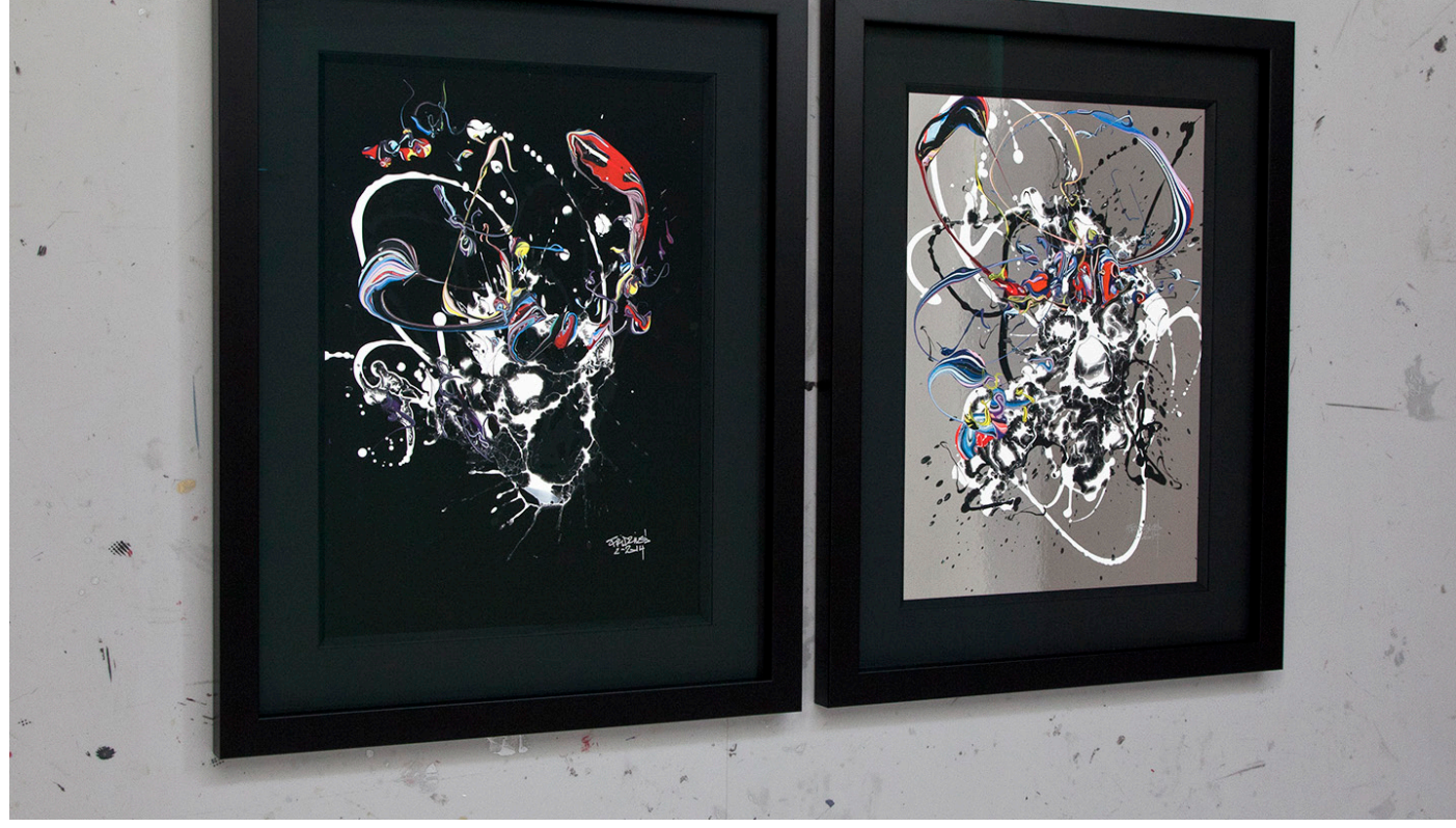
"Skylanders - reflected paper n2 & n3" - 64x45cm (framing 86x67cm - museum glass) acrylic on reflective paper (gr 370) - 2014