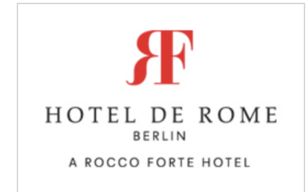
BERLIN - Interstellar Spaces

Exhibition running from Sept. 27 to Oct. 27 2018