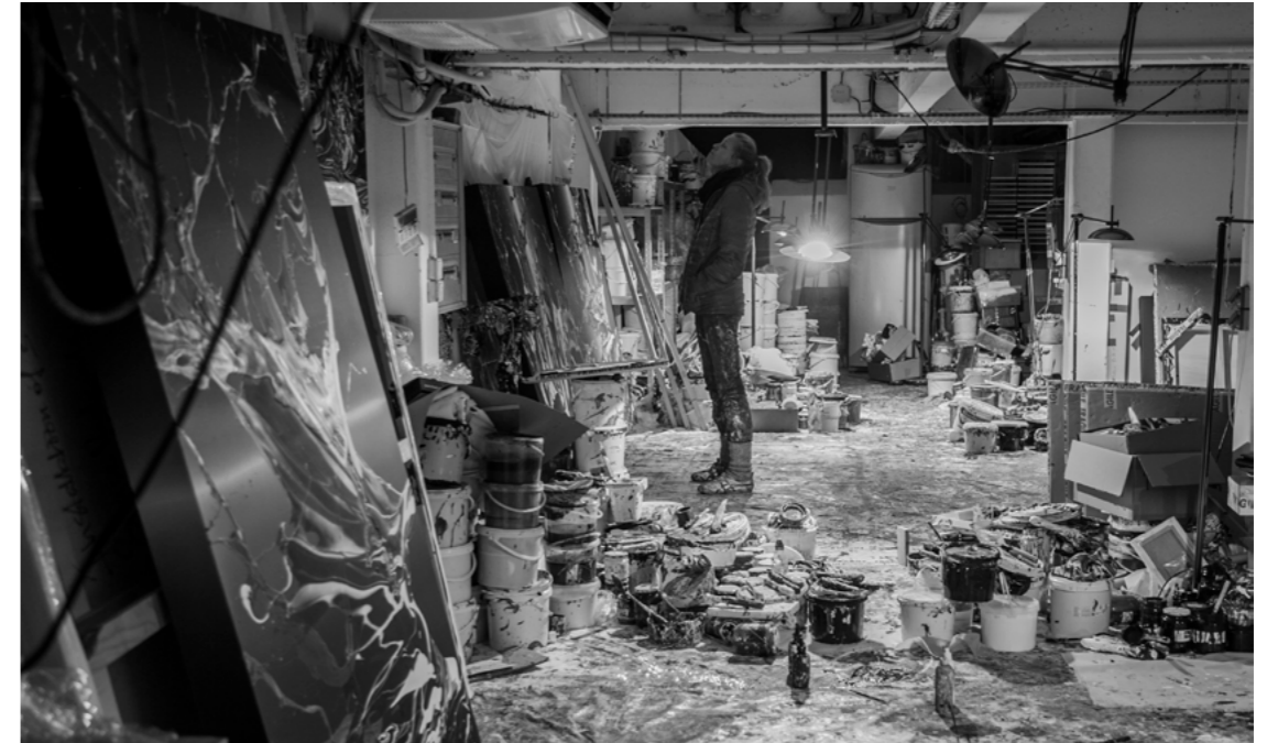
Katrin Fridriks in her studio

It turns out it is something until recently just definable but an ancient word and mostly used in sacred texts and spiritually, but that has recently made a comeback, vindicating itself in the