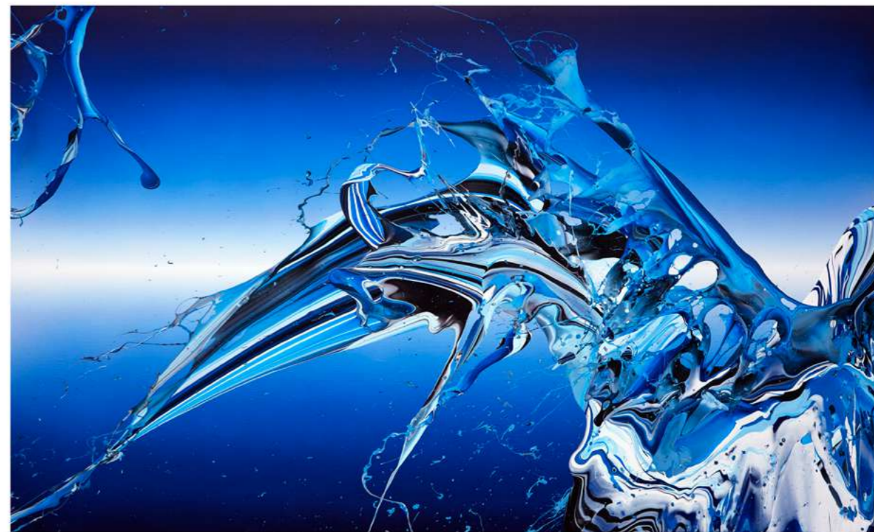
Cosmic Stargate - Portal Activation, 2021