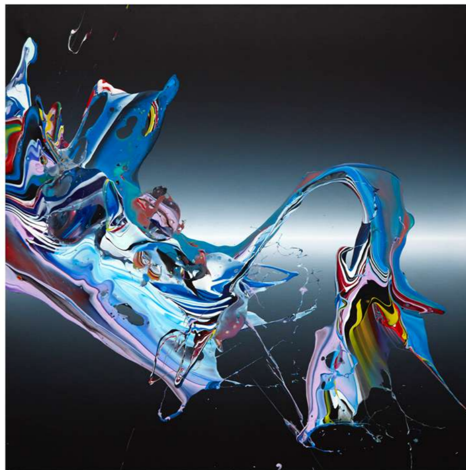
Ultime Spark of Divinity - God Mind, 2021