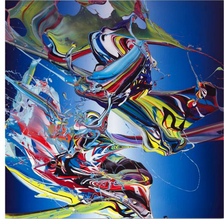
Cosmic Tree of Life, 2021