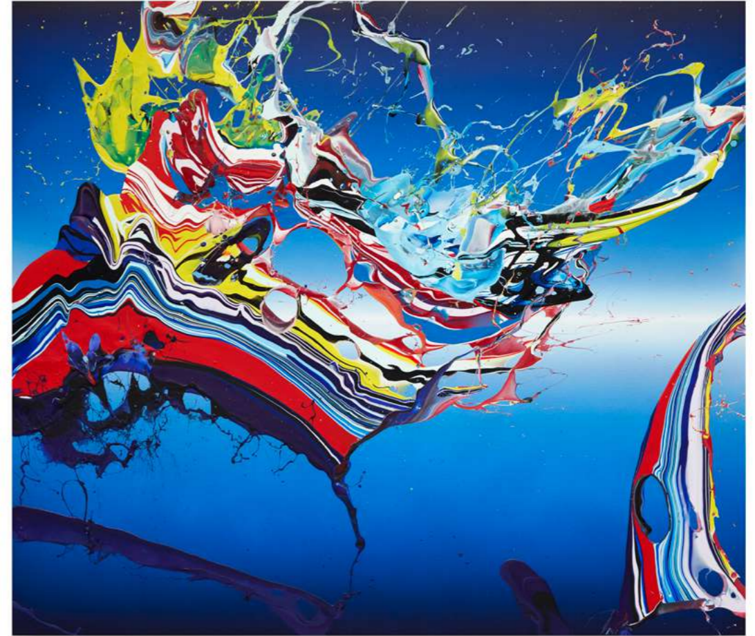
Galactic Federation - Beam of Light, 2021