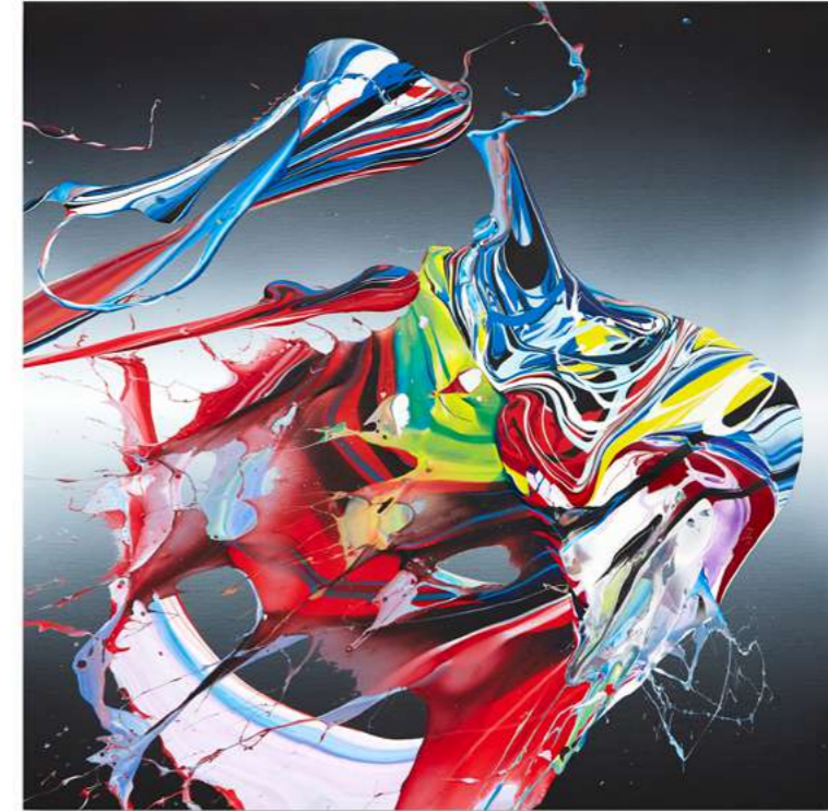
Legend of Mantis - Cosmic Reader, 2021