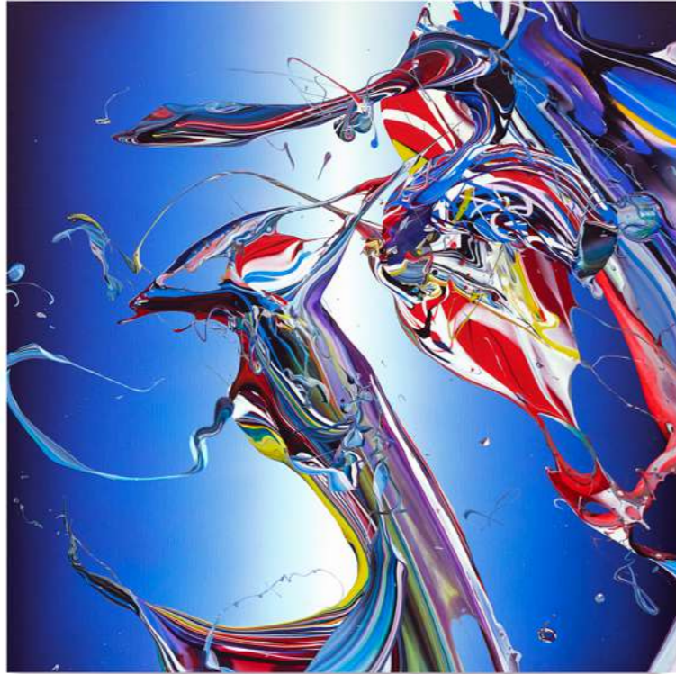
Telephatic Awakening, 2021