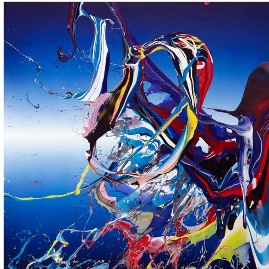
Magnetic Life Force, 2021