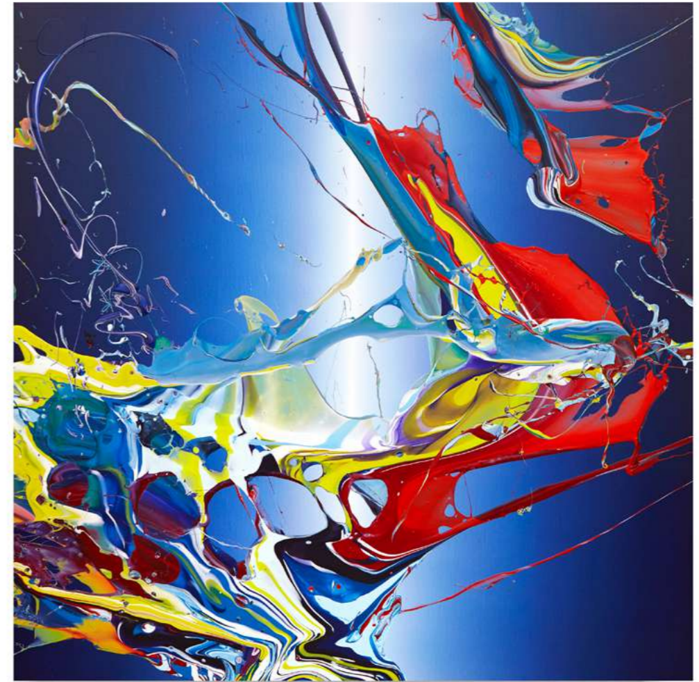
Kingdom of Cosmic Consciousness, 2021