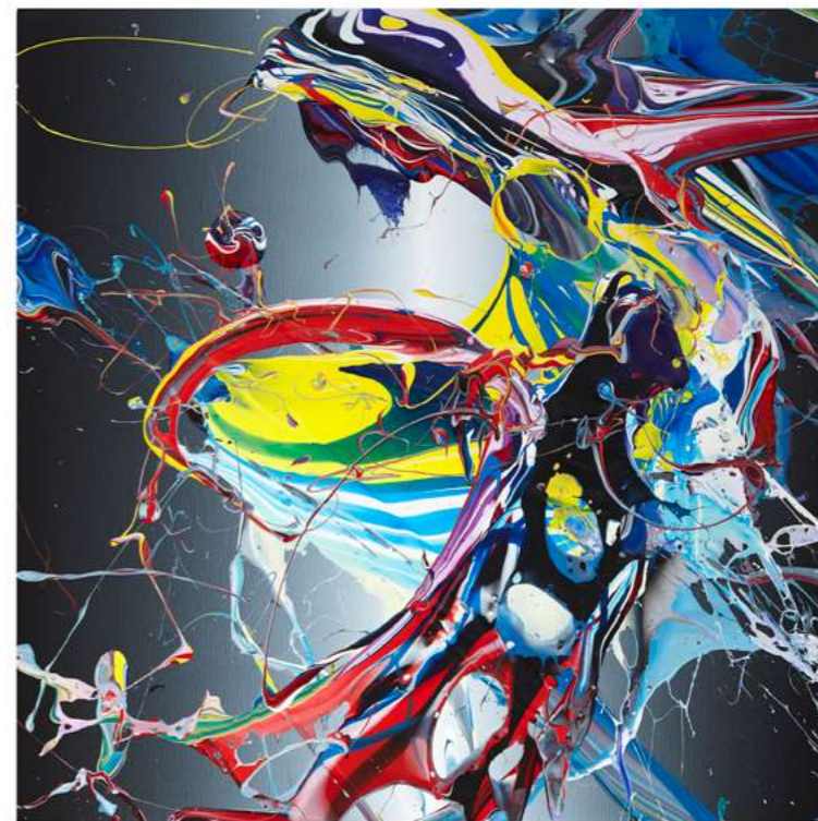
Royal Serpentine - Mystical Garden of Eden, 2021