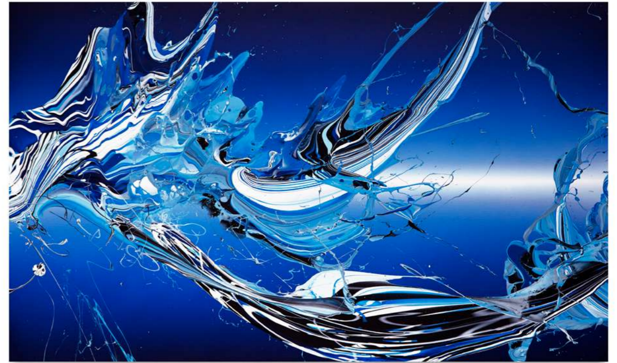
Cosmic Stargate - Earths Plane I, 2021