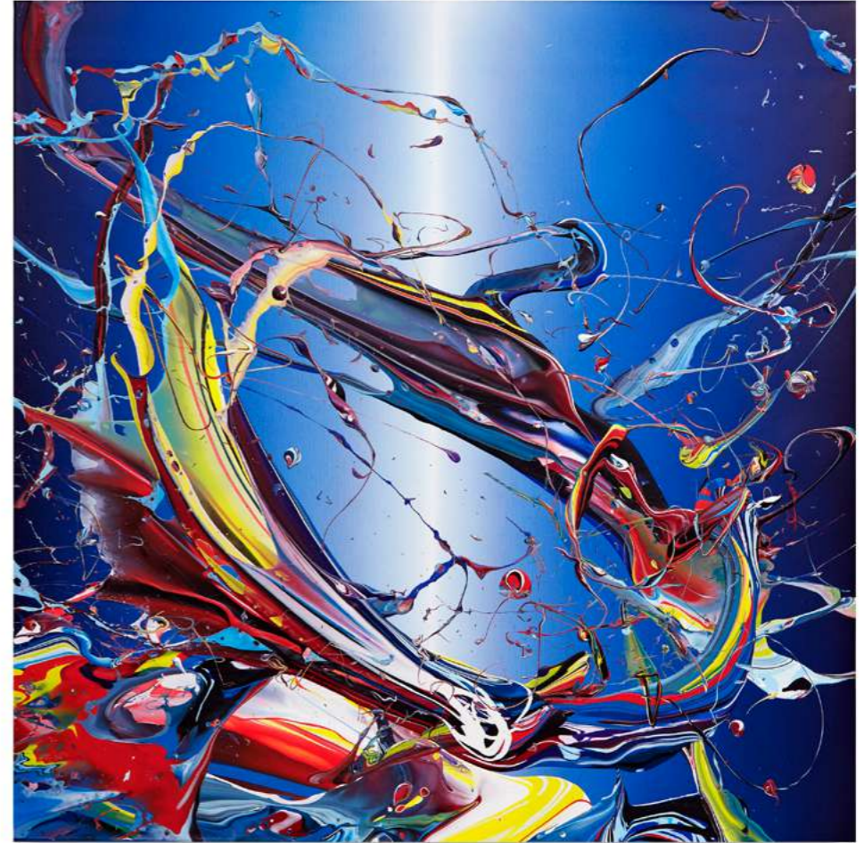
Soul Traveler, 2020