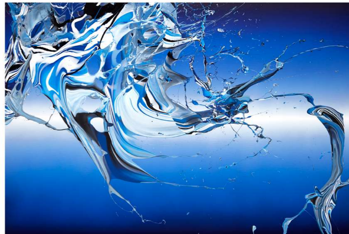
The Nobel Astral Soul Keepers, 2021