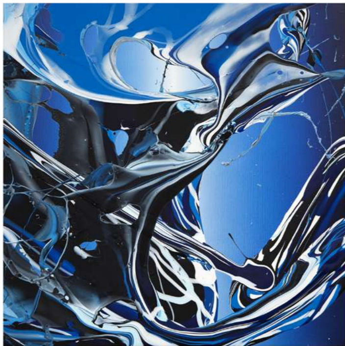
Cosmic Intelligence - True Blue Ascension, 2021