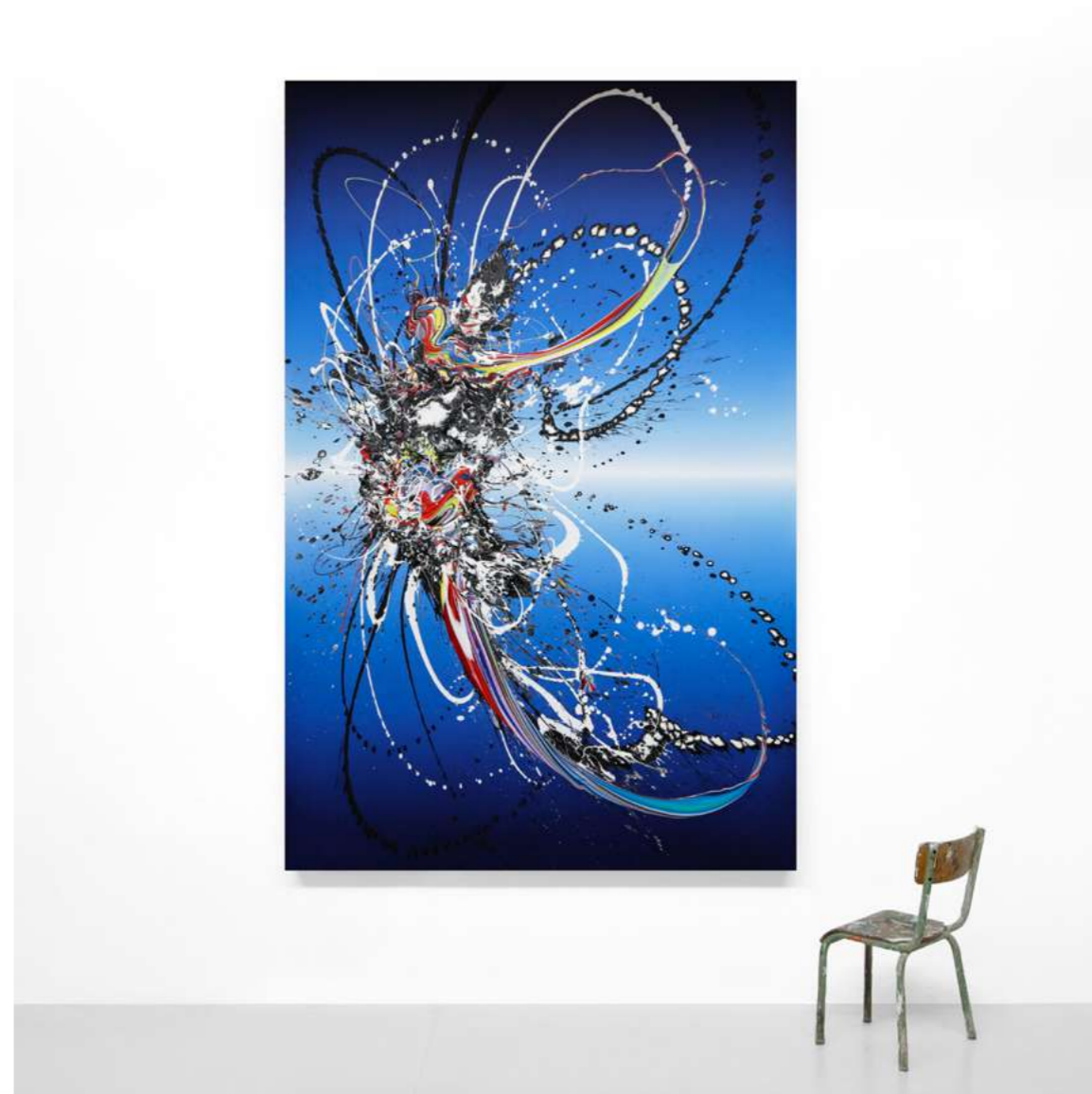
Noble Messenger - Blue Avians Alliance, 2020